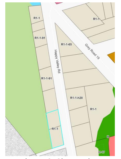
Figure 1. Site and Area Context Map