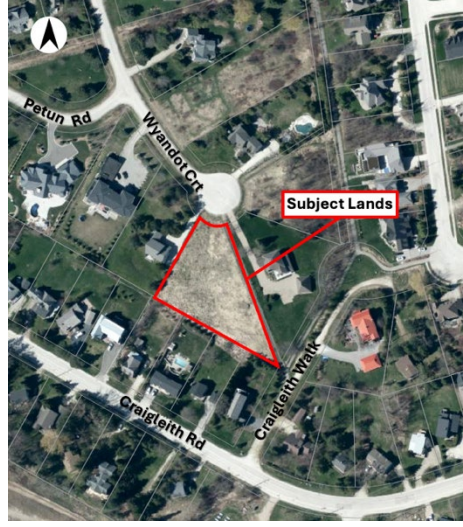
Figure 1. Aerial Context Map

The subject lands are located at 151 Wyandot Court, within an existing residential neighbourhood comprised of single detached dwellings ( Figure 1 ). The property is located at the end of the court, with a frontage of 15.34 metres and an approximate size of 3,546.05 square metres (0.87 acres). The depth of the property is 61.37 metres. As shown in Figure 2 and Figure 3 , a new single detached dwelling is under construction. Other residential dwellings at the end of Wyandot Court are located on similarly large lots with considerable front yard setbacks ( Figure 4 ).