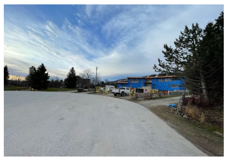
Figure 2. Subject Lands