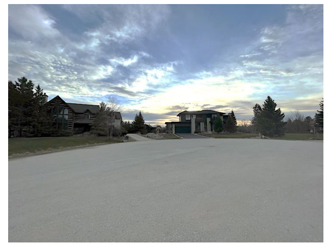
Figure 3. Subject Lands and Adjacent Property