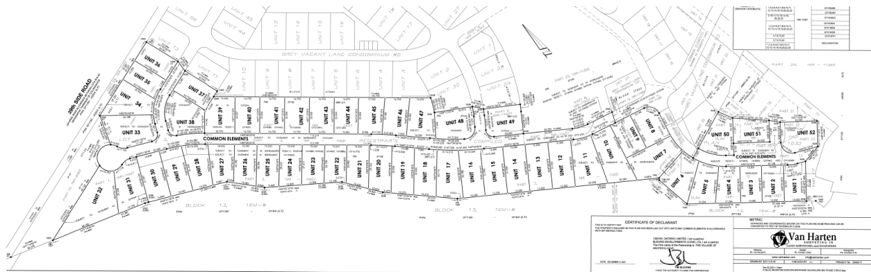
Figure 3: VLCP No. 127

The Cottages at Lora Bay (Phase 5) has subsequently been legally subdivided as Vacant Land Condominium Plan No. 127. An except of Vacant Land Condominium Plan No. 127 is provided below as Figure 3.