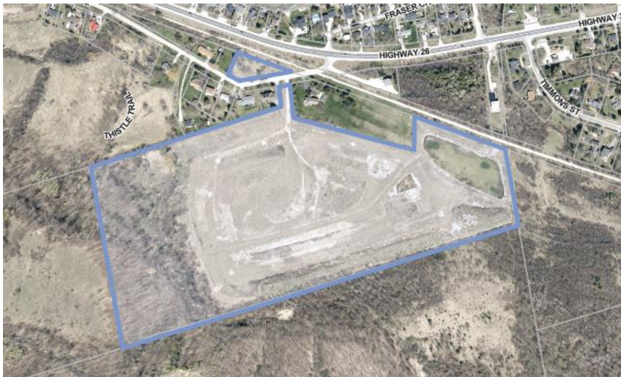
Figure 1: Air Photo

The h27 holding provision on the subject lands requires that the following be fulfilled: