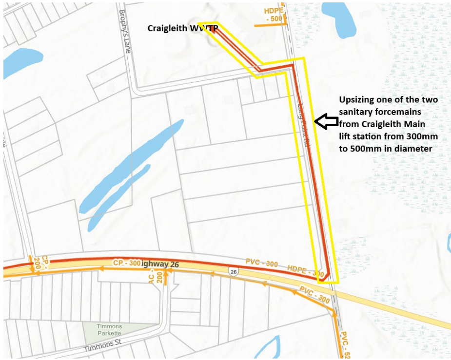
Map Indicating Watermain Replacement