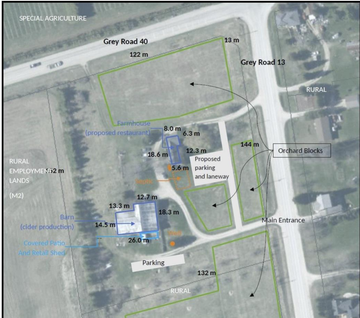
Figure 3: Submitted Site Plan

As noted, both properties are under 2 HA in size.