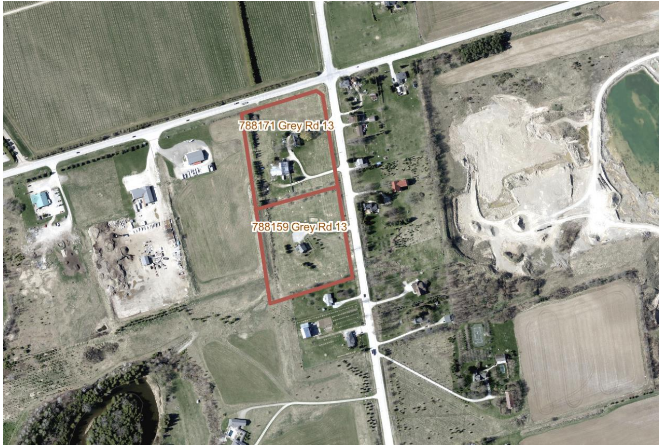
Figure 1: Air photo showing 788171 Grey Rd 13 (Grey & Gold) and 788159 Grey Rd 13 (Owners' residence) – separately titled.

Both properties fall within a designated Aggregate Resource Area which appears on Official Plan Appendix 1 – Constraint Mapping shown in Figure 2 below