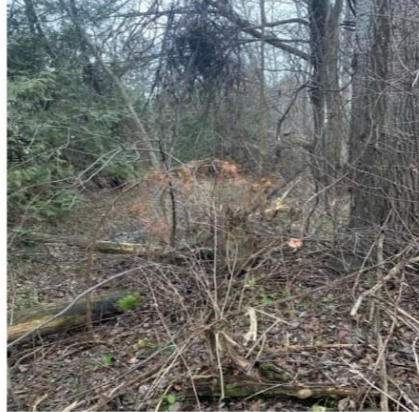
E. Existing Tree Canopy and Vegetative Buffer adjacent to backyards of Lakeshore Drive Residences: