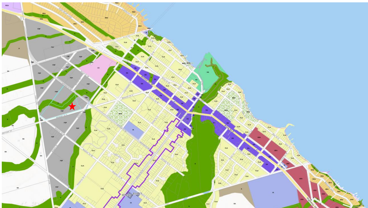
Figure 2: Official Plan Designations (2016 Town of The Blue Mountains Official Plan)

The lands are located within the Thornbury/Clarksburg Community which is within the urban settlement boundaries of both the County of Grey Official Plan and Town of The Blue Mountains Official Plan. The lands are designated Future Secondary Plan (Shown in Grey) which applies to most parcels of land in Thornbury between the Little Beaver River, the 10 th Line and Highway 26. (See figure 2)