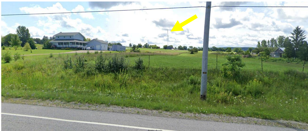
Figure 4 View of Proposed Tower from subject property (south of Ravenna) on Grey Rd 2