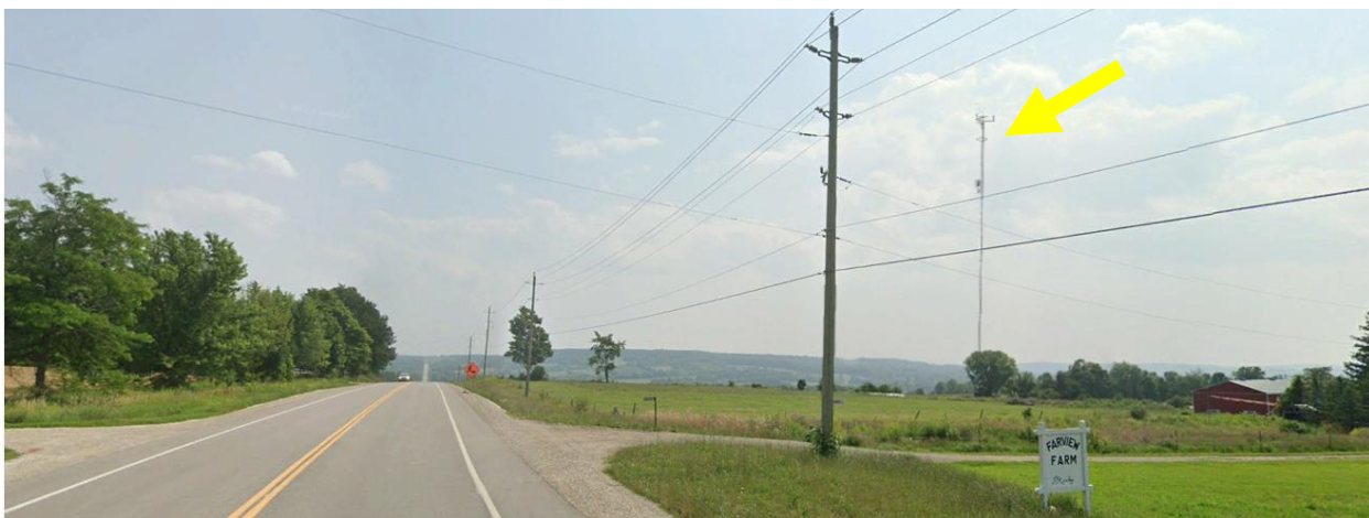
Figure 5 View of Proposed Tower from Grey Rd 2 immediately east of site