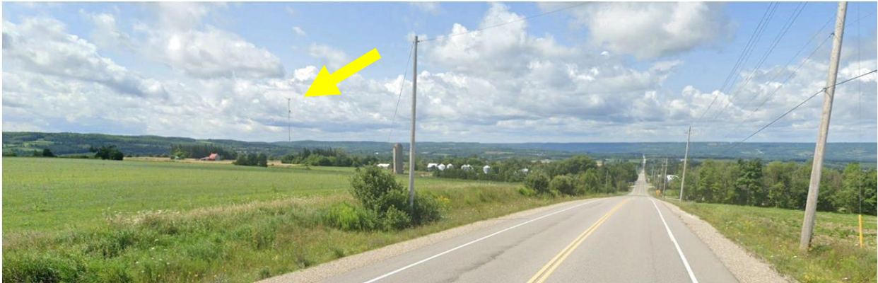
Figure 3 View of Proposed Tower from West of Ravenna on Grey Rd 119