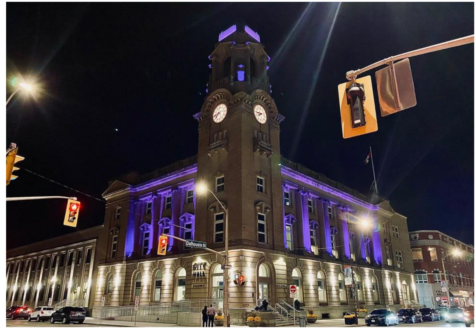
Brantford, ON, City Hall

Light It Up! For NDEAM is a one-night, national co-ordinated special lighting event in recognition of National Disability Employment Awareness Month (NDEAM)