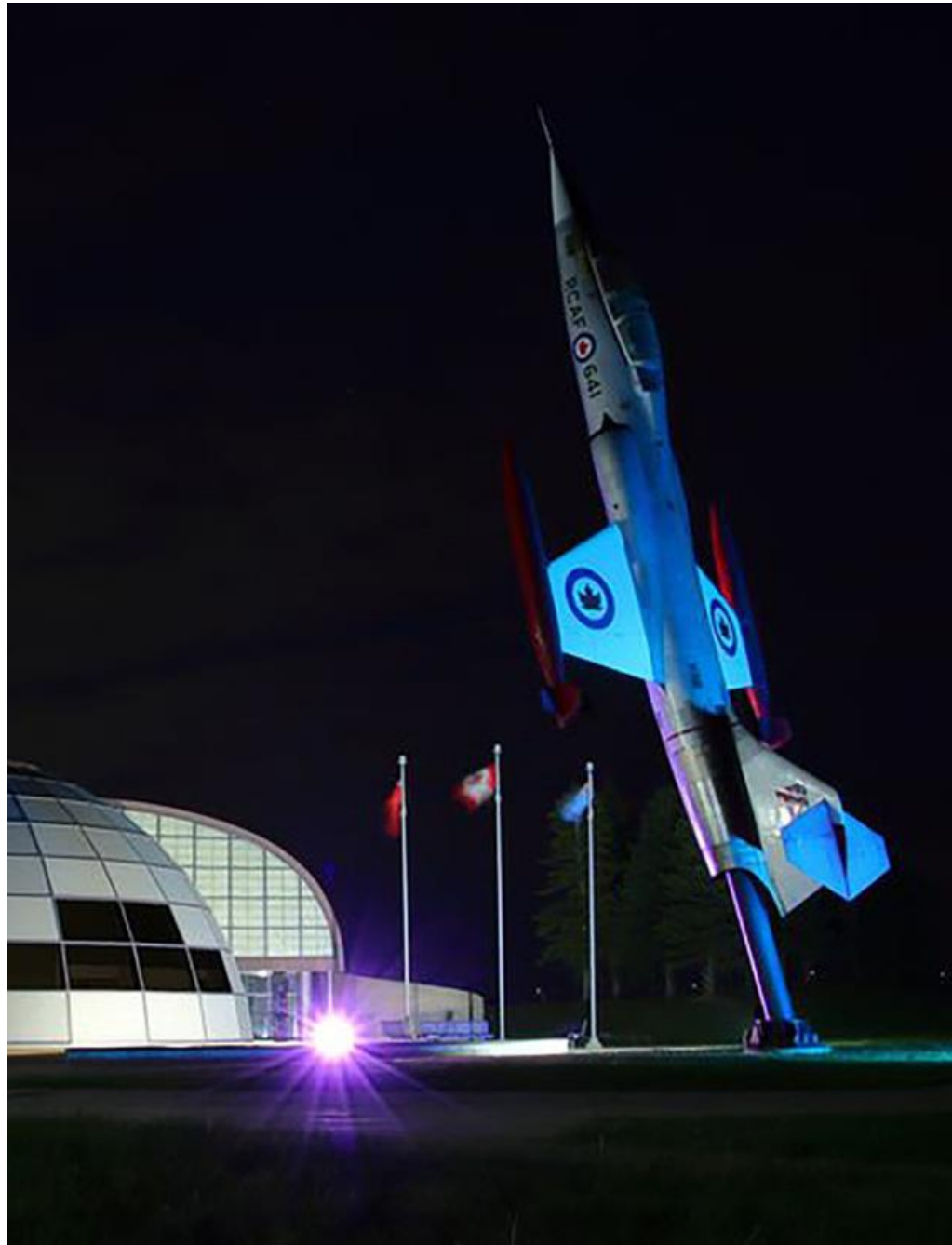
CF-104 Starfighter, Canadian Warplane Heritage Museum, Mount Hope, ON