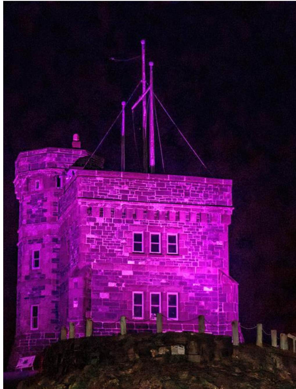
Cabot Tower, Signal Hill National Historic Site, St. John's