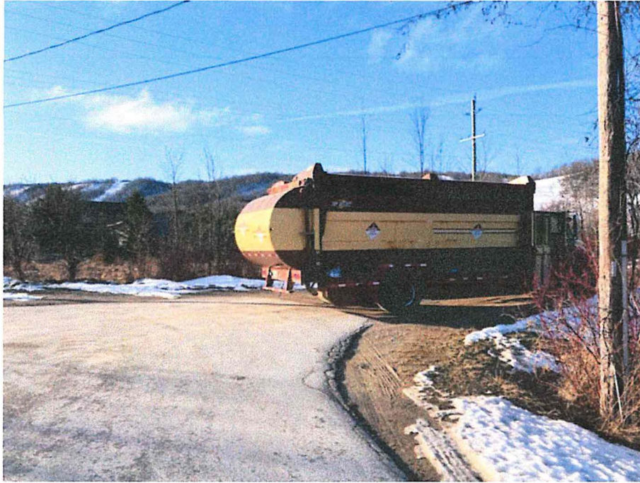
Existing Truck Turnaround on Town Surplus Property