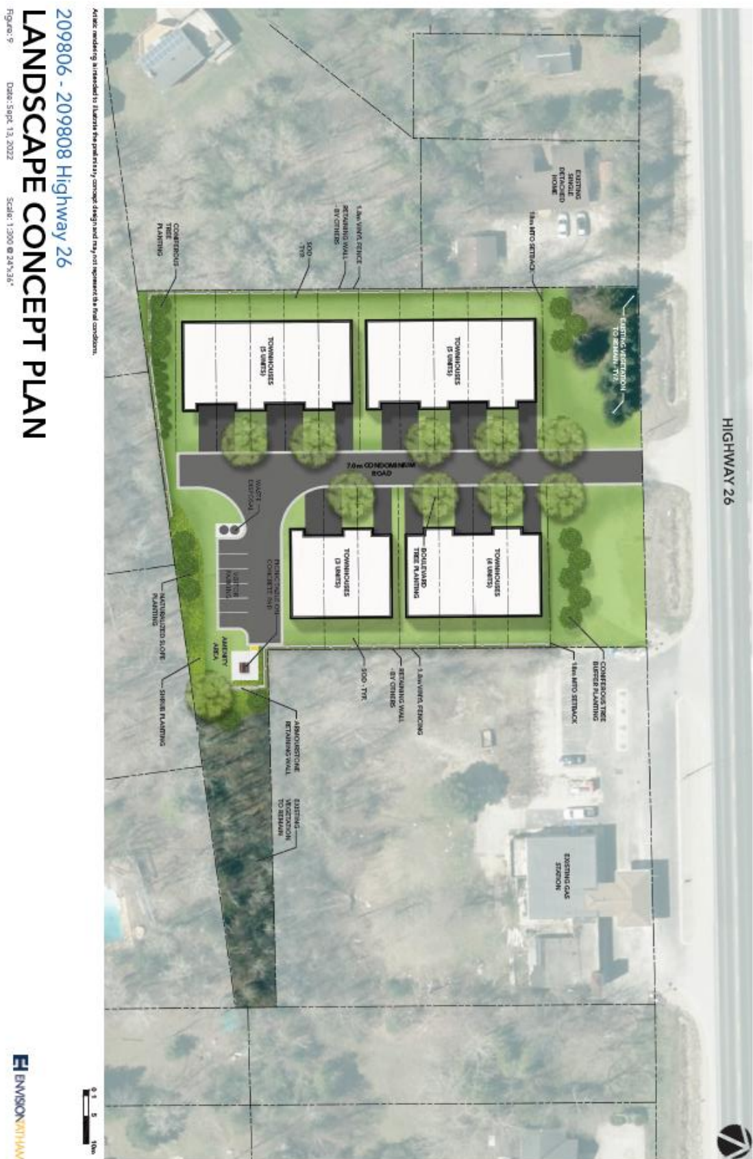
209806 - 209808 Highway 26 LANDSCAPE CONCEPT PLAN Figure 9 Date: Sept. 13, 2022 Scale: 1:300 @ 24"x36"

If a person or public body does not make oral submissions at a public meeting or make written submissions to Town of The Blue Mountains before the by-law is passed, the person or public body is not entitled to appeal the decision of Council to the Ontario Land Tribunal.