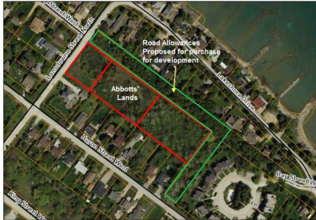
Figure 1: Aerial photo of the subject lands proposed for development

The Abbotts' lands in red are approximately 1 hectare (2.5 acres). The road allowances of Bay Street and Victoria, shown in green, are approximately 0.7 hectares (1.73 acres).