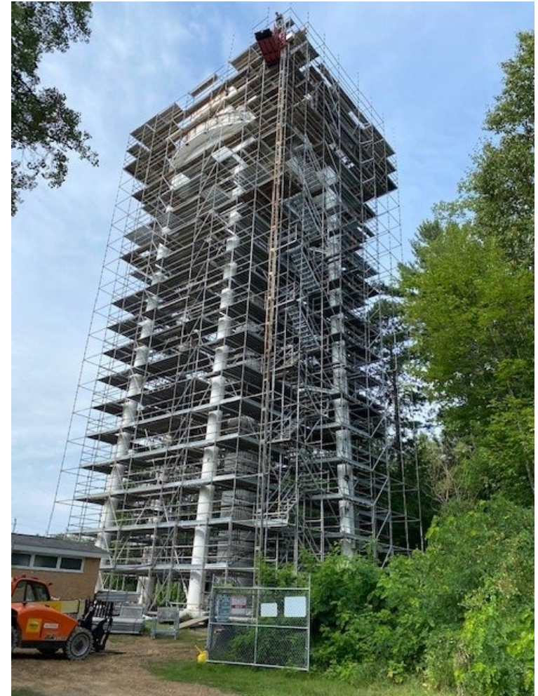
Image of Water Tower Rehabilitation in Deep River, Ontario