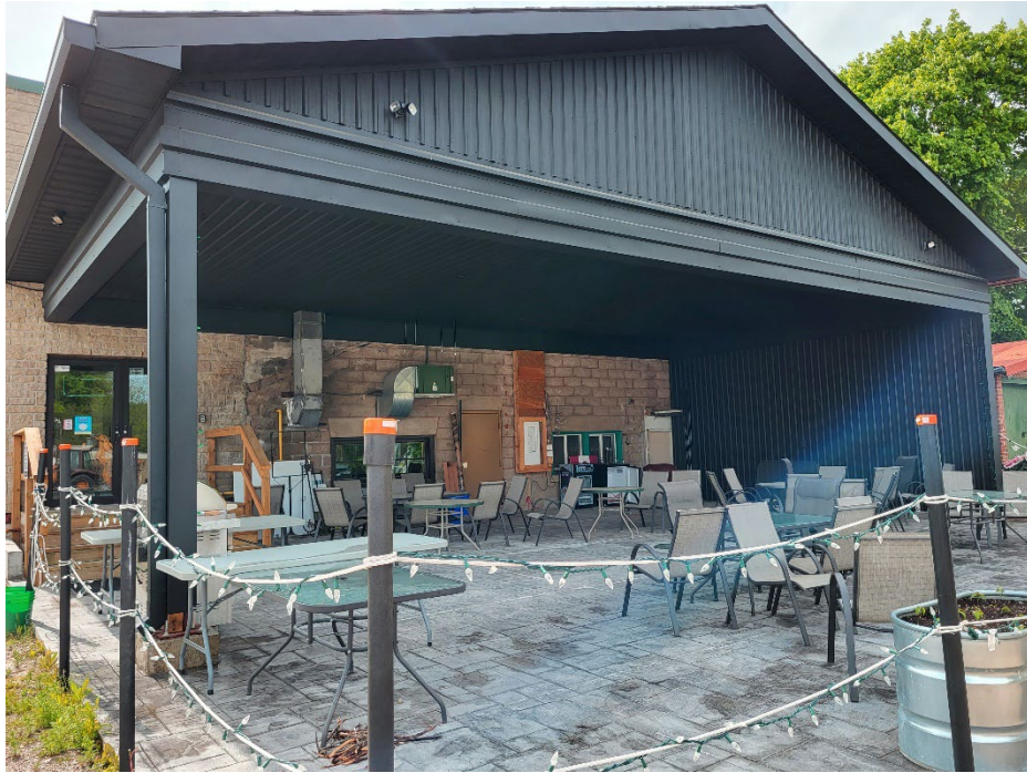
Marsh Street Centre patio project