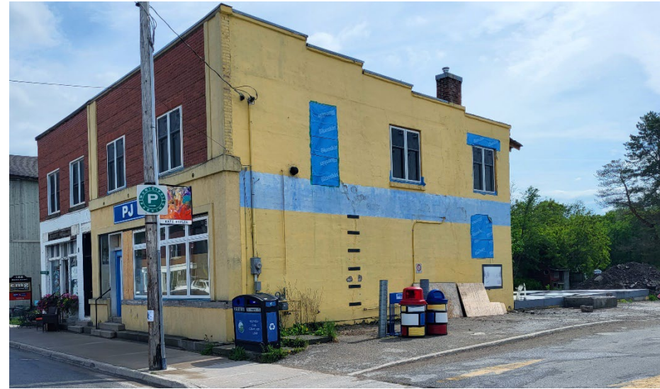
PJ Mart rejuvenation