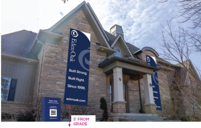
EDEN OAK NORTH EXTERIOR ENTRANCE