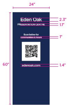
EXTERIOR PRESENTATION CENTRE HOURS SIGN SIZE: 24" x 60" BOXED IN SIGN