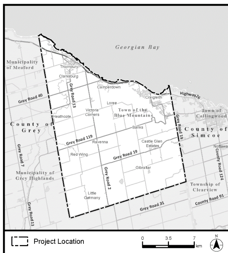
Figure 1: Study Area

The study area for the TMP includes the entire Town of The Blue Mountains, within Grey County, as shown in Figure 1 .