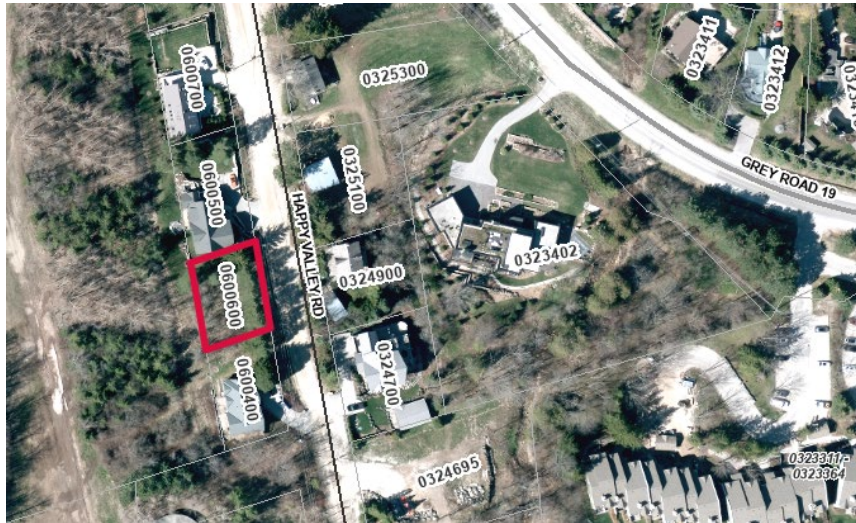
Figure 1. Site and Area Context Map