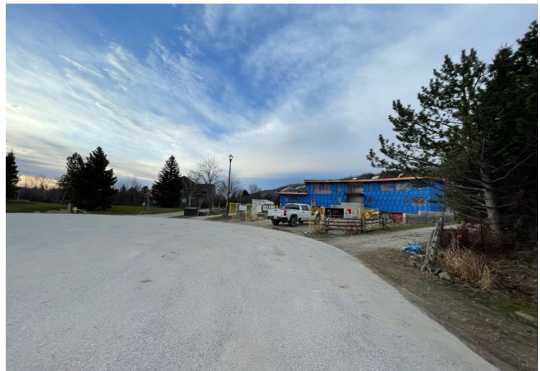
Figure 2. Subject Lands