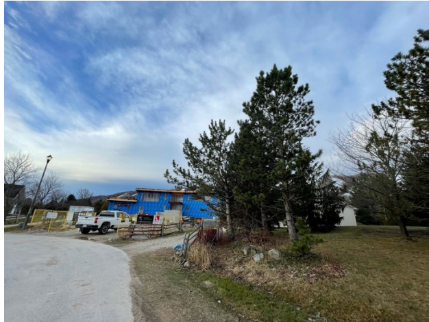
Figure 3. Subject Lands and Adjacent Property