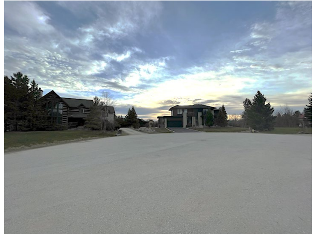
Figure 4. 146 and 148 Wyandot Court

The applicant wishes to construct a circular driveway, ramp and parking area in the front yard, as shown in Figure 5 . Subsection 5.3.2 (b) of the Zoning by-law, relating to the size of driveways, requires a minimum of 50% of the front or exterior side yard in which the driveway is located to be landscaped. A minor variance is requested to subsection 5.3.2 (b) to permit a front yard with approximately 33% landscaping. The remainder is proposed to be paved.