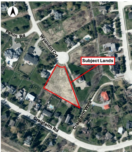
Figure 1. Aerial Context Map

The subject lands are located at 151 Wyandot Court, within an existing residential neighbourhood comprised of single detached dwellings ( Figure 1 ). The property is located at the end of the court, with a frontage of 15.34 metres and an approximate size of 3,546.05 square metres (0.87 acres). The depth of the property is 61.37 metres. As shown in Figure 2 and Figure 3 , a new single detached dwelling is under construction. Other residential dwellings at the end of Wyandot Court are located on similarly large lots with considerable front yard setbacks ( Figure 4 ).