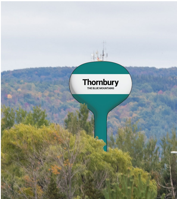
Option 3 - Green/White/Blue