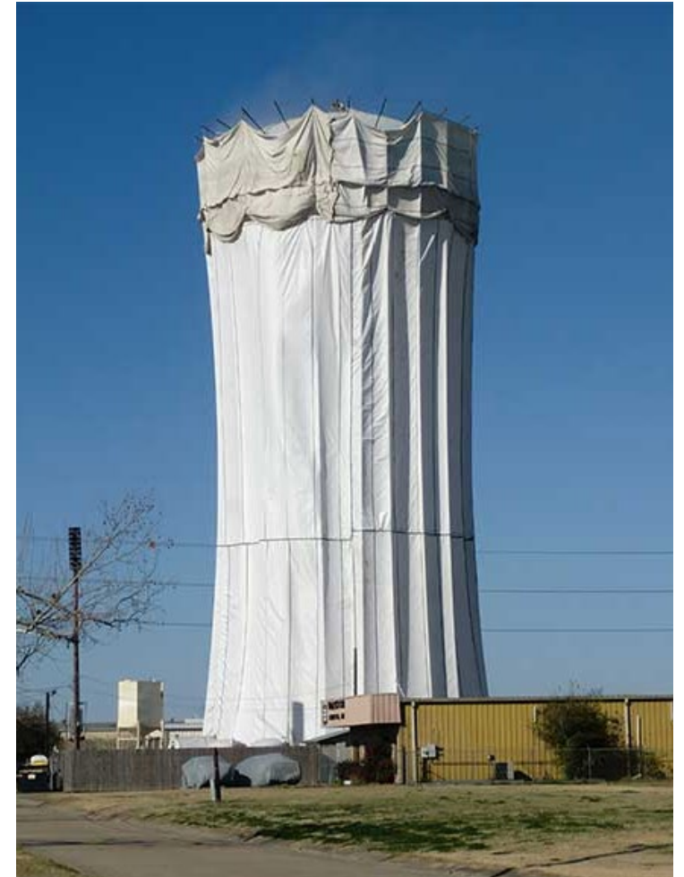
Image of Water Tower with lead containment shroud