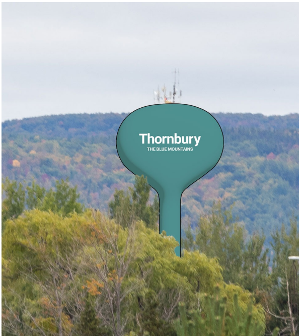
Option 3 - Blue