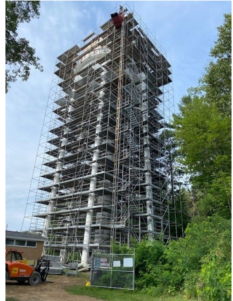
Image of Water Tower Rehabilitation in Deep River, Ontario